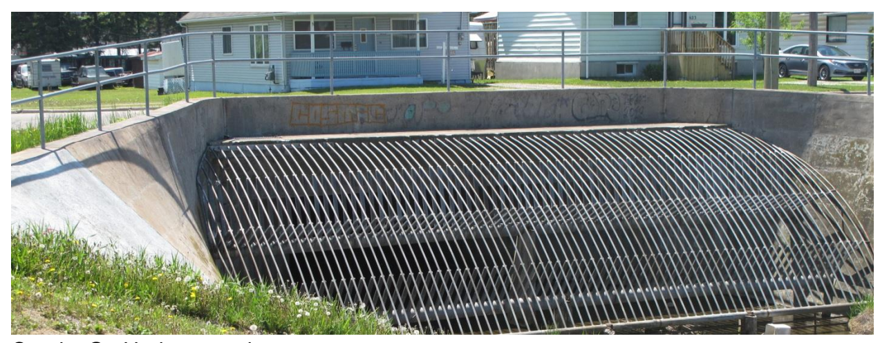
Creeks Go Underground

This channel starts north of the Korah Road pond and flows in a man-made channel to just north of Wallace Ter where it goes underground. Flow is constant but light.