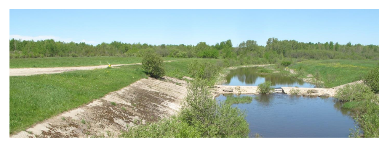
Bennett - West Davignon Diversion Channel - Base Line Rd

This creek's east branch crosses the Second Line east of Allen Road – has moderate flow and is clear and well shaded. This branch joins a man-made channel just north of Wallace Ter that is a diversion of West Daviginon Creek. The diversion channel continues until the creek branches join north of the Base Line.