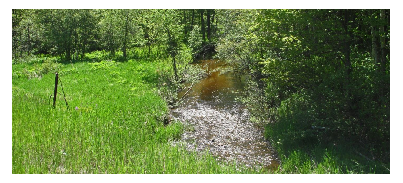
Natural Creek – Bennett Creek

This creek's west branch has multiple tributaries that cross the Third Line west of Goulais Road – There is moderate flow – streams are in natural channels and well shaded – there are some large culverts. Some culverts are perched. The water is clear.