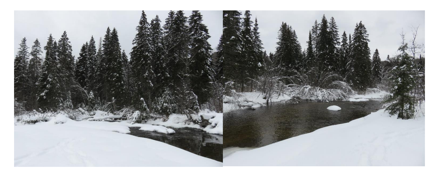
Walking downslope to Dam Creek was relatively easy – "what goes down must come up again" and the climb back to the Ranger Lake Road was a little more challenging – with plenty of rest stops to listen for birds.