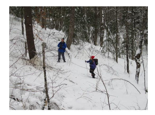
Other wildlife observations included a site where a fox had caught a mouse and some likely Bobcat tracks in the snow.