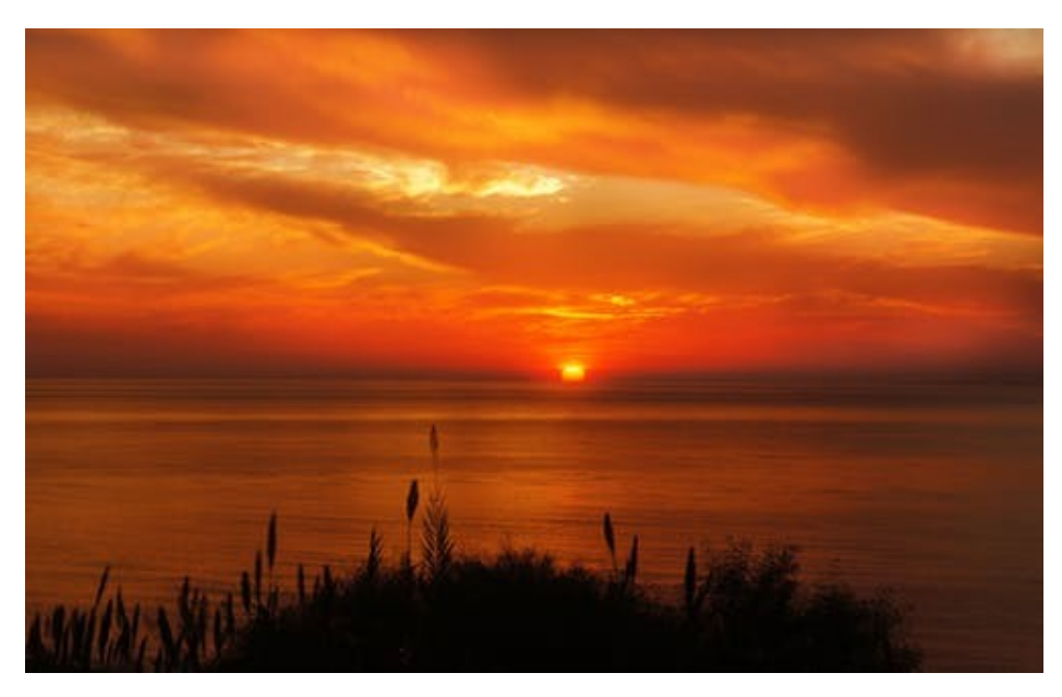
At the end of the day, you can rest assured that the Roach Point trail is better than it was.