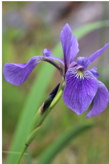
Blue Flag Iris (Iris versicolor)