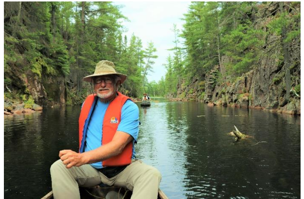
En route thru the gorge to the Black Hole