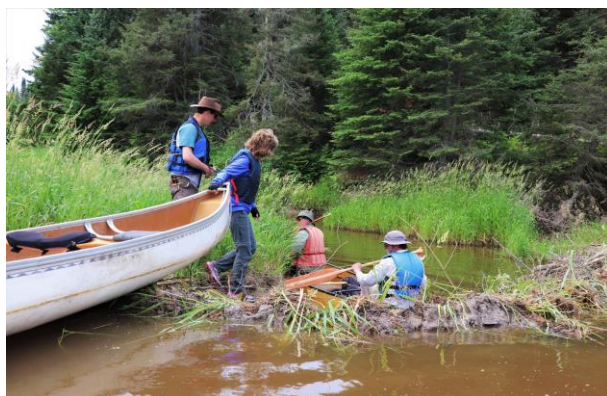
Yet another beaver dam