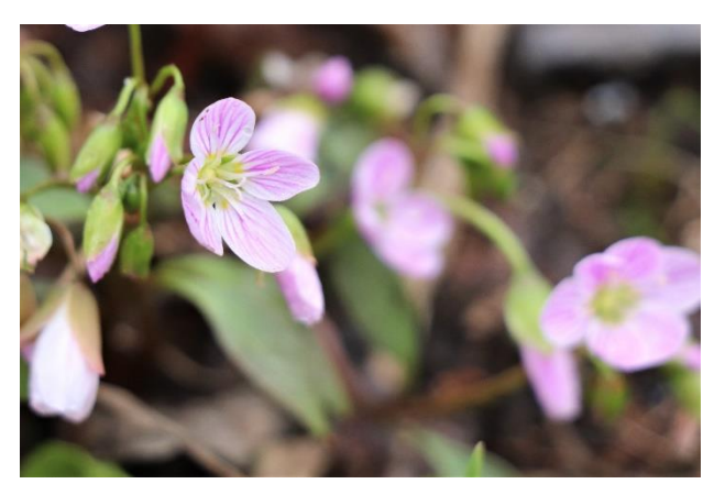
Spring beauty (Claytonia caroliniana)

Wildflowers were in abundance and everyone had a nice day.