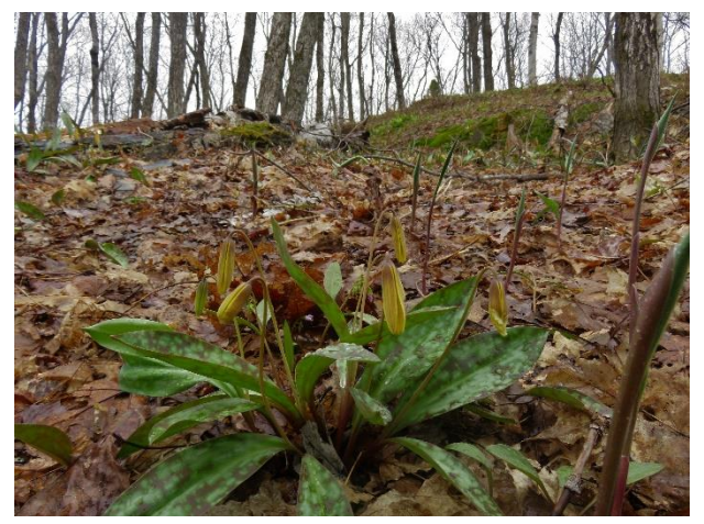
Trout lily (Erythronium americanum)