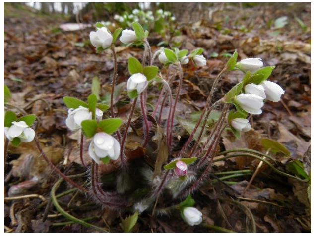
Round-lobed hepatic (Anemone americana)